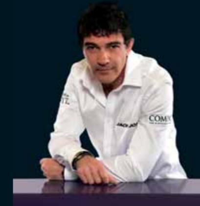
Official Sponsor of the team by Antonio Banderas

LIFETIME WARRANTY QUARTZ COMPAC SURFACES FOREVER